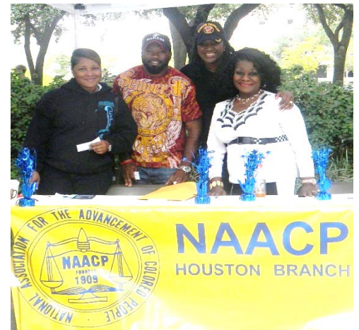
Veterans Committee at Veterans Day Event

To gain more insight into the needs of members of the armed services; their families; and veterans and their families the committee began a survey on Veterans Day. To ensure a valid survey the committee will be visiting housing and other facilities that serve veterans.