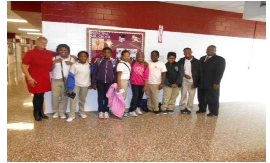
Reading Initiative Students at Cullen Middle School

The Education Committee has kept a watchful eye on the Houston Independent School District. An alarming percentage of minority students are unable to read on grade level. School closures in minority schools is disproportionately high and finally the loss of quality programs and teachers tends to provide a poor delivery of educational services in the minority communities throughout the inner city.